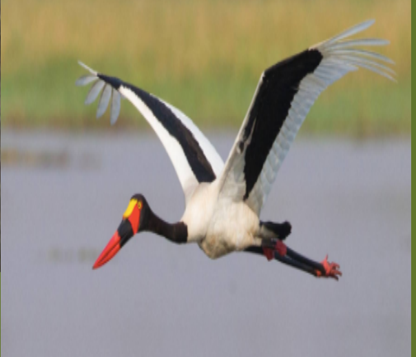
just make YOU a fan! There are birds you won't even see in aviaries!!!

There's still space as well as the 2 single accommodations.